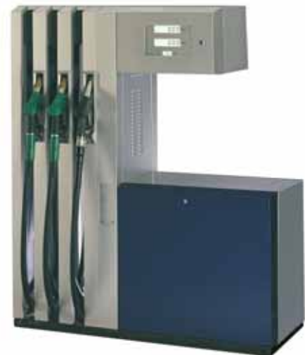
Global Star LHR Square