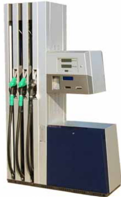
Global Star HH with PT